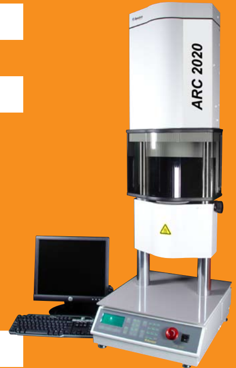
ARC 2020 with computer